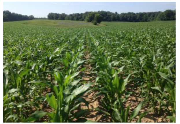
MSU Extension is also here to assist farmers, families and individuals with issues such as succession & estate planning, budgets, and cost production.

"In the weeds" discusses critical issues facing our farming industry every other week. Farmers can participate by phone, mobile device or by playing the audio. <u>https://www.canr.msu.edu/</u>