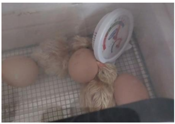
Youth learned about animal science by participating in a number of fun projects and trainings in the Embryology Program.

Through structured 4-H activities, Montcalm County youth gain a variety of skills to help them become successful in communication, teamwork and organization.