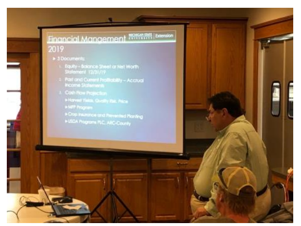
MSU Extension is here to assist farmers, families and individuals within the farming community when issues arise.